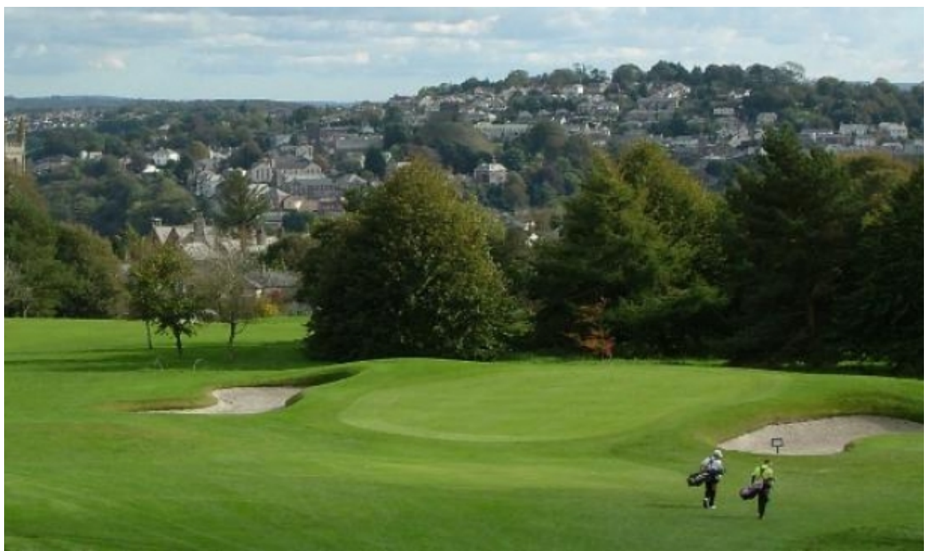
The Launceston Golf Club is a great course for walkers and the course has wonderful views of nearby Launceston.

The game of golf in Launceston was first played in 1910. That year, a group local dignitaries built a few holes on a piece of property which was owned by the Williams family of Werrington Park. This course was on the western edge of the current Launceston Golf Club. The game of golf was played here until the beginning of World War I. Locals didn't really start playing golf again until 1927, which is the year that the Launceston Golf Club -- launcestongolfclub.co.uk / -- was officially founded.