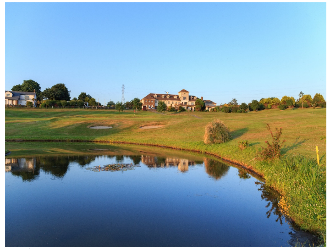
The 18<sup>th</sup> hole at Bowood Park includes a large lake on your left as you approach the green.

course and makes for an excellent warm-up to a full round, the benefit of which you will feel when you reach the 600-yard 7th! On the way, you will pass some of the 26 lakes and ponds which adorn the course.