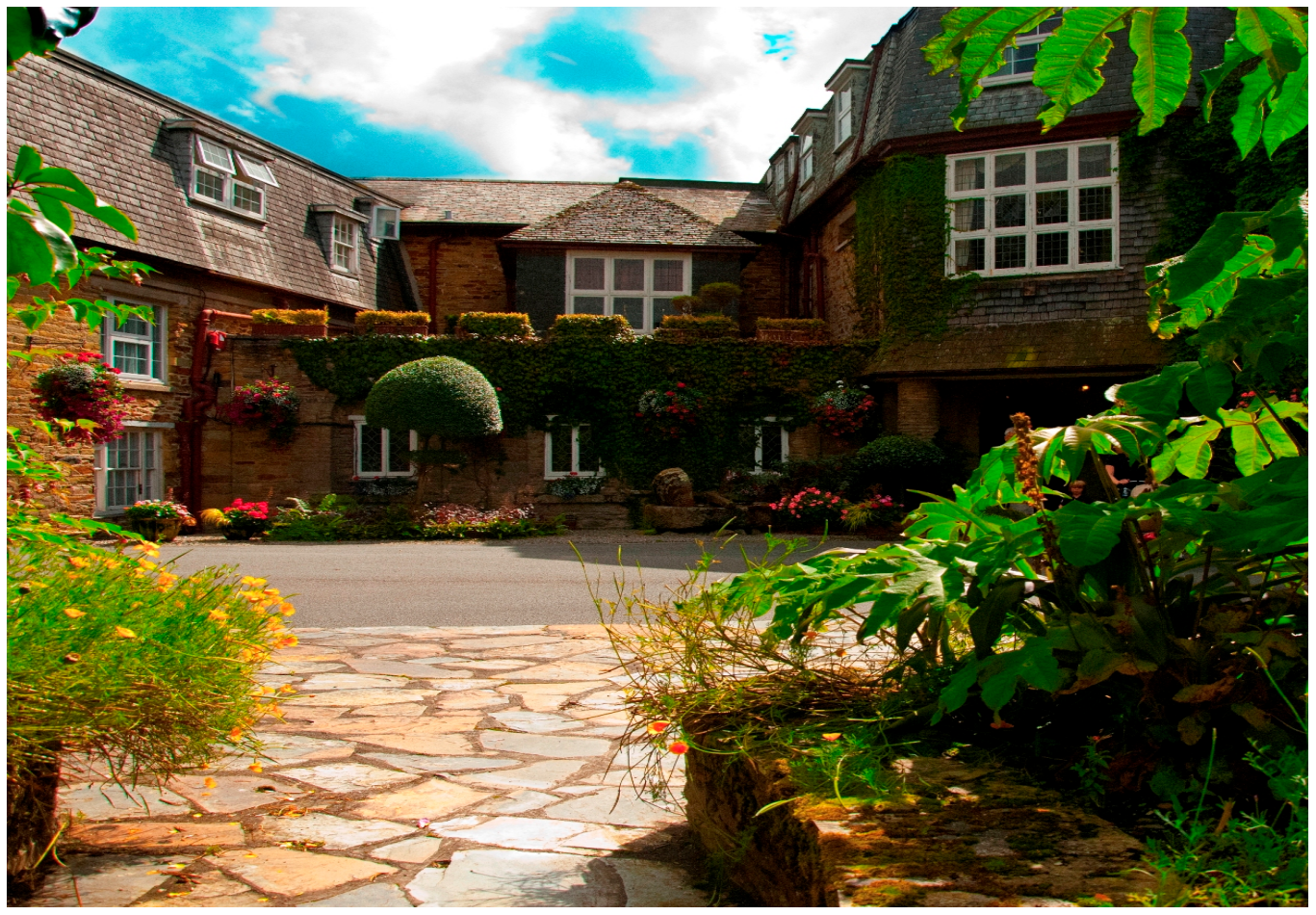
The front entrance of the Budock Vean Hotel.

The rooms are second-to-none at the Budock Vean. Everybody who plans to stay for a week usually wishes that they had made plans to stay for a month. In addition to being beautifully designed and decorated, these rooms have every modern convenience that you can imagine or will ever want. The standard extras include flat-screen remote control TV, free wi-fi, telephone, hair dryer, Elemis spa toiletries, and tea & coffee making machines. You are encouraged to use and enjoy the bathrobes and slippers which you will find in each room. And, of course, a complementary bottle of Cornish water can be found in every room, as well. Those bottles of water can be consumed on the premises or taken home as a souvenir from your Cornish getaway.