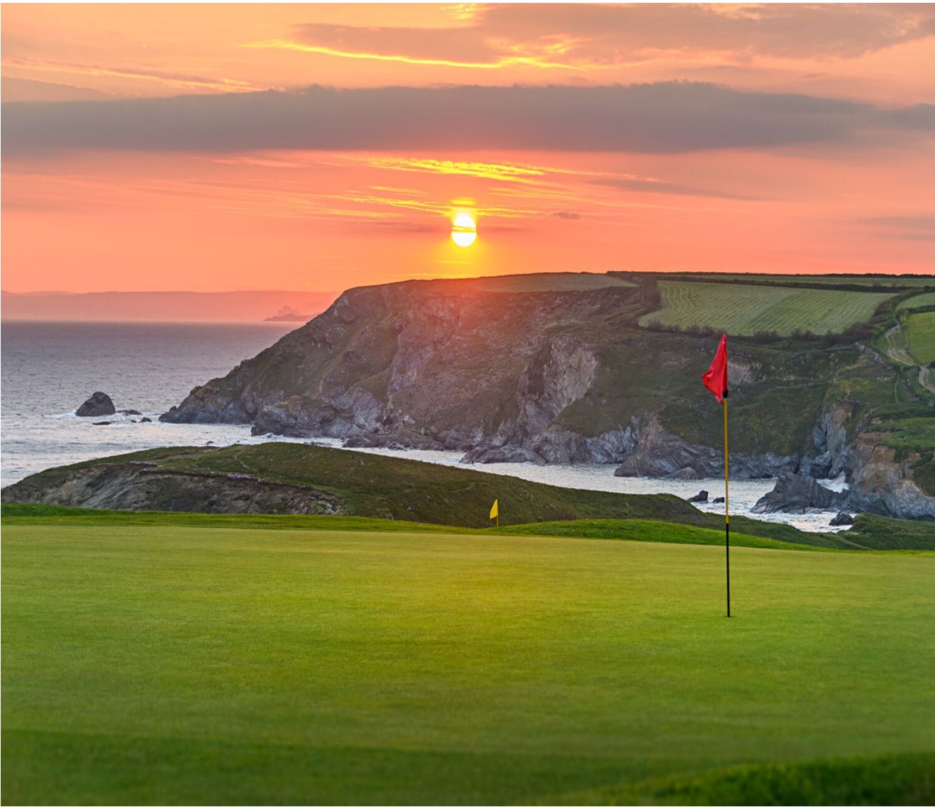
The setting sun over the Mullion Golf Club is majestic and perfect for a postcard

trouble. For the balance of the back nine, only one hole is longer than 400 yards and that's the par four 15<sup>th</sup>, which is usually played into the wind, which adds to its degree of difficulty. To score well on the inward nine, it's important to pay attention to the wind, the contour of the fairway, and don't get distracted by Mullion's natural beauty. You can always go sightseeing after golf.