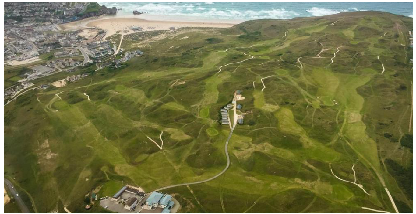
The Perranporth GC, located on Cornwall's northern coast, overlooks the North Atlantic Ocean.

Adding to the mystique and allure of the Perranporth Golf Club is the fact that each hole has a name, listed in two languages – English and the old Cornish language.