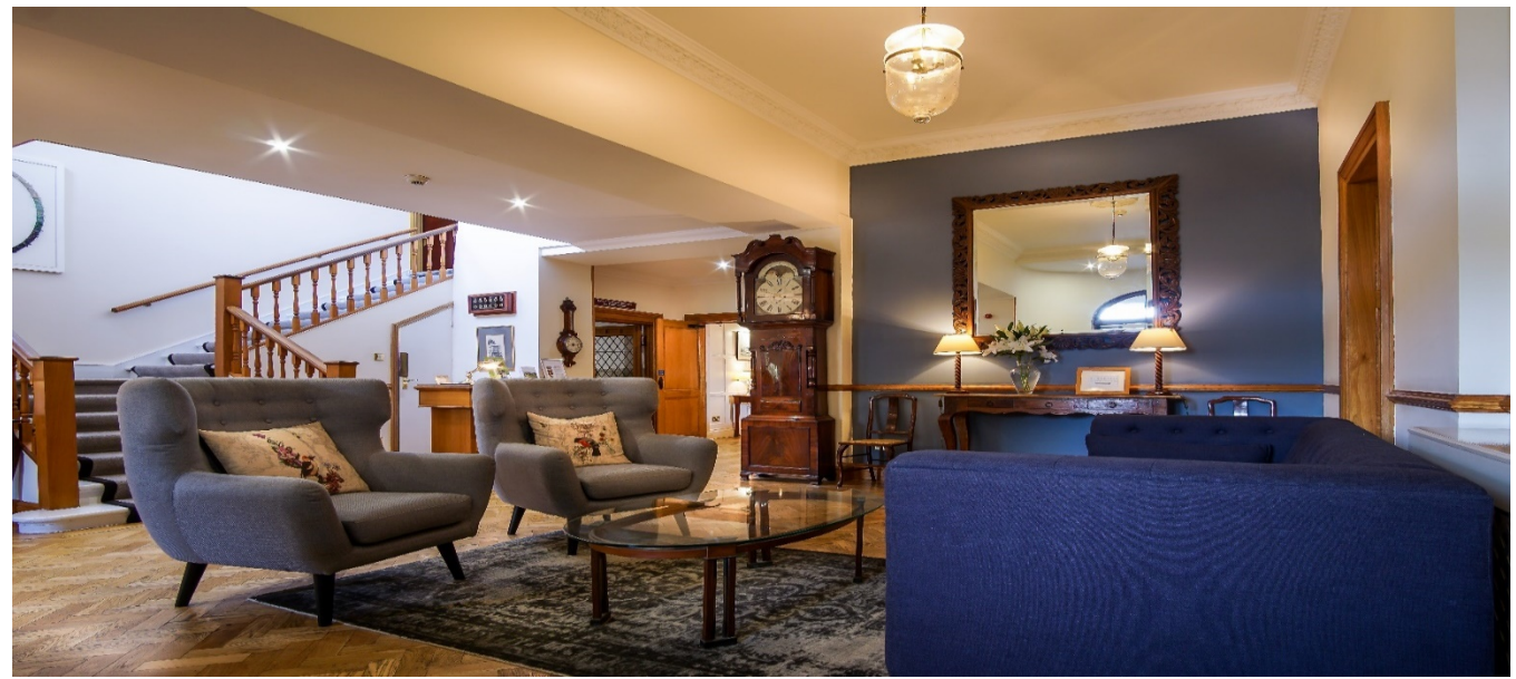
The lobby of the Budock Vean Hotel is classy and comfortable.

Whether you are relaxing or having an out-and-about type of vacation, you will undoubtedly develop an appetite for the first-class cuisine that is prepared every day for the guests at the Budock Vean Hotel. It's worth noting that this hotel has earned awards and recognition for its delicious food and first-class service. In addition to dining in the restaurant, guests can enjoy lunch, afternoon tea, and dinner in the cocktail bar, terrace, and conservatory.