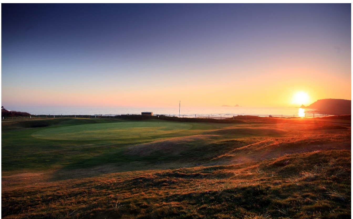
The summer sunset over the Trevose Golf & Country Club is a peaceful sight.

At every point on the golf course, you can hear the sound of the nearby crashing surf. Unlike many links golf courses, there is a meandering stream that winds its way around the course so the nearby Atlantic Ocean is not the only water hazard at Trevose.