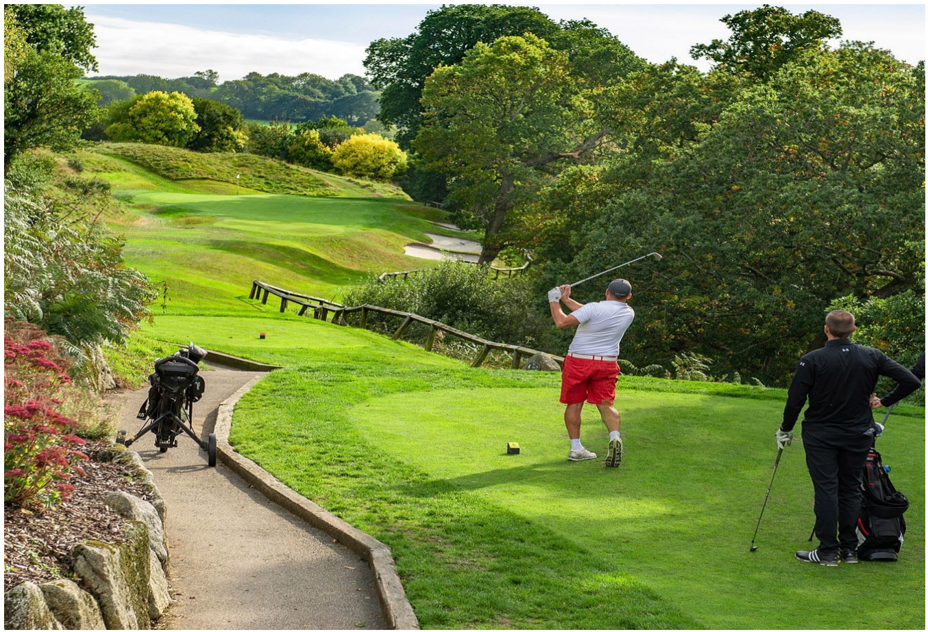
St. Mellion is not only popular in Cornwall, as it attracts golfers from throughout Europe.

"I knew it was going to be good, but not this good," remarked Nicklaus.