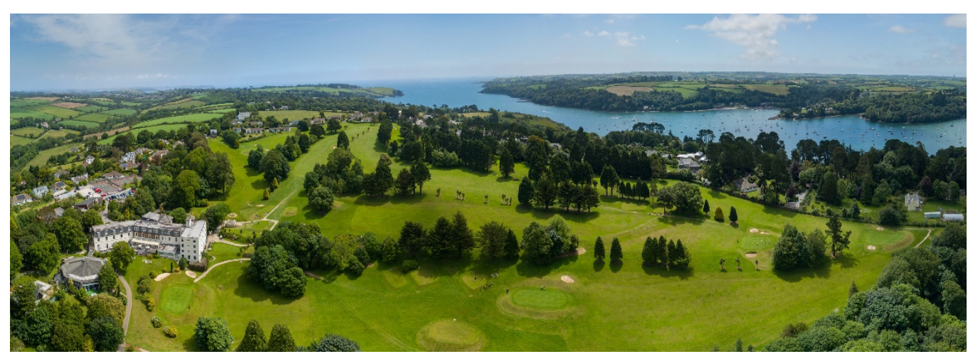
An aerial image of the Budock Vean Hotel and its golf course, with the River Helford in the distance.

If you prefer a vacation where you wish to be pampered and treated like royalty, then you should take advantage of every treatment available at the Budock Vean's Natural Health Spa. They include massages, facials, manicures, pedicures, and salt scrubs. You will also have to make time to enjoy the sauna and the outdoor hot tub, as well as the indoor pool.