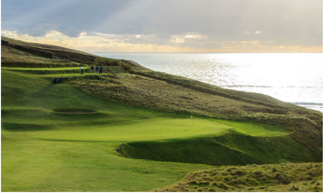
The Mullion Golf Club has unmatched views of the Atlantic Ocean and nearby Mounts Bay.

has wooden steps that allow you to enter and leave the sand with ease. But, it's best to avoid that bunker all together. As you conclude the front nine, it's an uphill trek to the 9th green, which is why it is called Cardiac Hill. But, when you arrive, the view out to sea will have been worth the effort to get there.