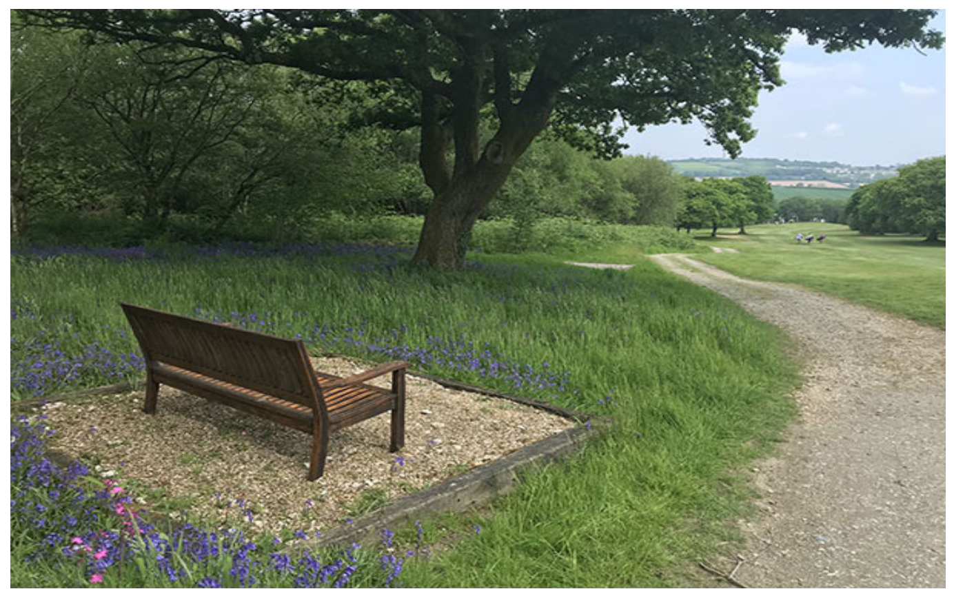
The views from the fairways at Lanhydrock provide stunning views of the Cornish countryside.

Golf Club, the two best holes were saved for last. The longest par three and the longest hole on the course can be found on the 17<sup>th</sup> and 18<sup>th</sup> holes -- the par-three 17<sup>th</sup> (201 yards from the tips) and the par-five 18<sup>th</sup> (570 yards from the tips). When playing the 9<sup>th</sup> hole, it's best to get a glimpse of the pin position on the 18<sup>th</sup> green so that you can maximize your chances of hitting your approach as close as possible to the 18<sup>th</sup> pin, as you conclude your round.